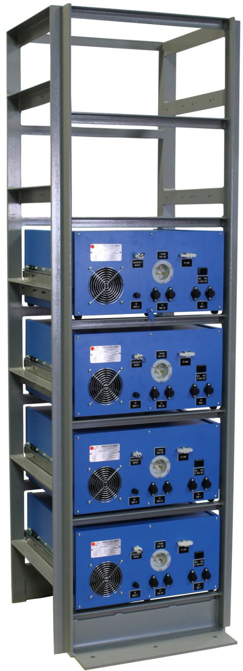
Rack for 6 Power Supplies

Darrah's Ampere Second Meters are predetermining time meters that can be selected to shut off the Power Supply at the end of the cycle. You can select either Coulomb/Ampere Seconds stop, Time stop, or Voltage Profile stop.