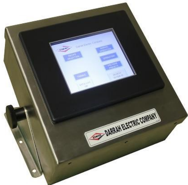
5.7" Color touchscreen control mounted in 10"W x 10"H x 5"D stainless steel tilt screen enclosure.