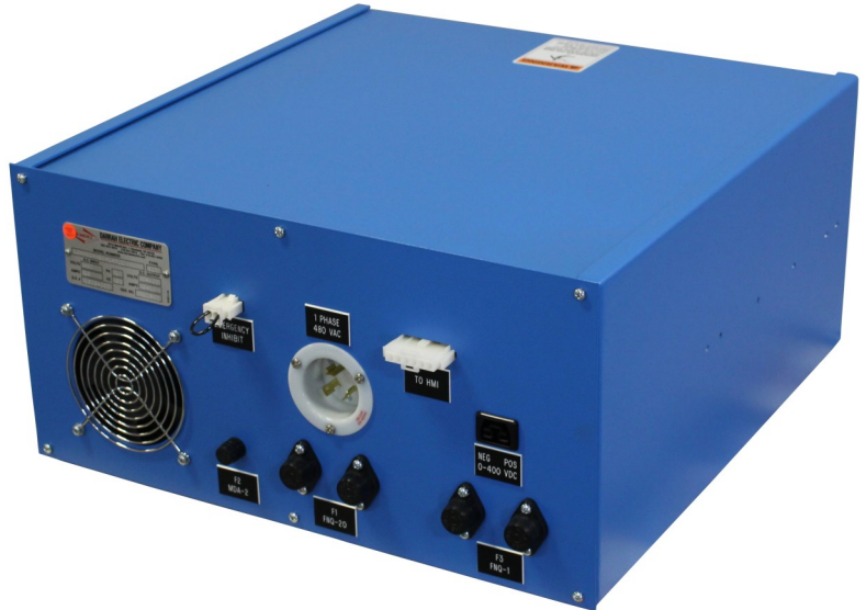
Microprocessor Controlled Power Supply